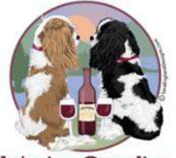
Interior Cavalier King Charles Spaniel Club SPECIALITY SHOW & SWEEPSAKES

Saturday, August 31st, 2024 Judge: Heather Langfeld