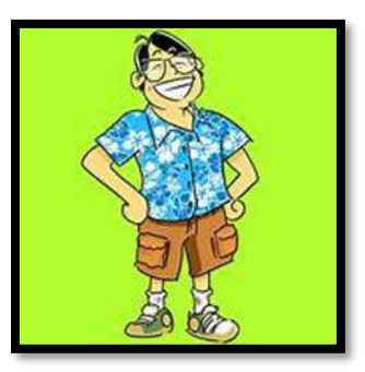
Casual Attire - Monday

Baby Puppy (Sat AM - Sun AM - Mon) Veteran (Sat AM - Sun AM - Mon) Juvenile & Veteran Sweepstakes - Sunday at noon Junior Handling - Saturday noon BBQ - Sunday after BIS Sponsored by: