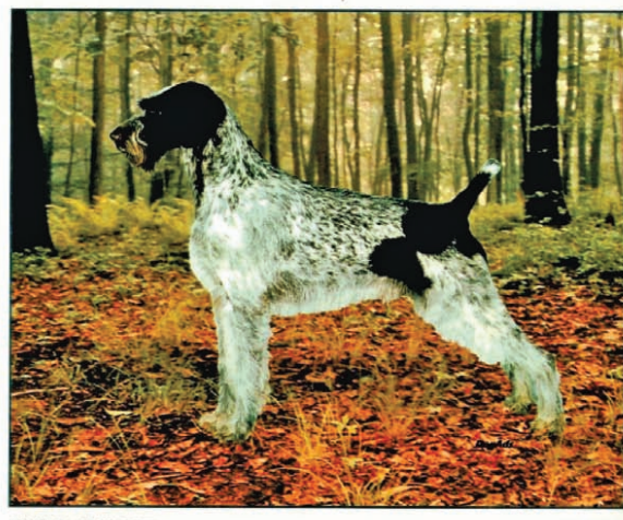
CANADIAN / AMERICAN CHAMPION RIPSNORTER'S IT'S SHOWTIME

BEST OF BREED GERMAN WIRF-HAIRED POINTER CLUB OF AMERICA NATIONALS 1996